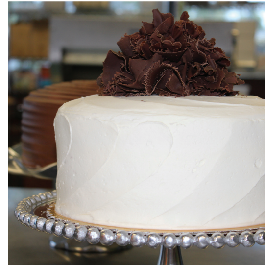
As featured on the Food Network and in Oprah Magazine