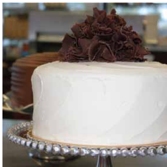
As featured on the Food Network and in Oprah Magazine